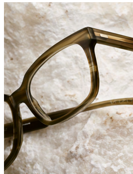
Acetate at its best, courtesy of REIZ.